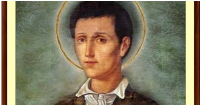
St. Nunzio Sulprizio Feast Day: May 5

Nunzio Sulprizio was born on April 13, 1817, in Pescara, Italy. His father died when Nunzio was only three years old. Nunzio’s mother remarried, but his stepfather paid no attention to him. Still, Nunzio faithfully attended Mass, prayed, and studied the lives of the saints. Their stories helped him learn how to live a holy, faith-filled life.