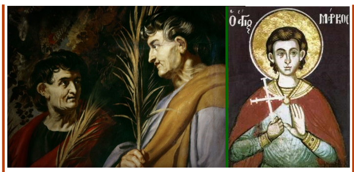
Sts. Nereus & Achilleus St. Feast Day: May 12