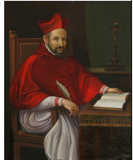
St. Robert Bellarmine Feast Day: September 17

Robert, born in Italy in 1542, was the third of ten children in a family in which prayer and serving others were priorities. He entered the Society of Jesus, the Jesuits, in 1560. Robert was a brilliant student at the Roman College and eventually taught at the University of Louvain in Belgium. His sermons and his defense of the faith