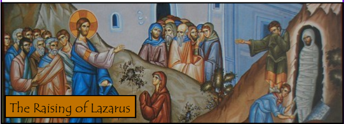
The Raising of Lazarus