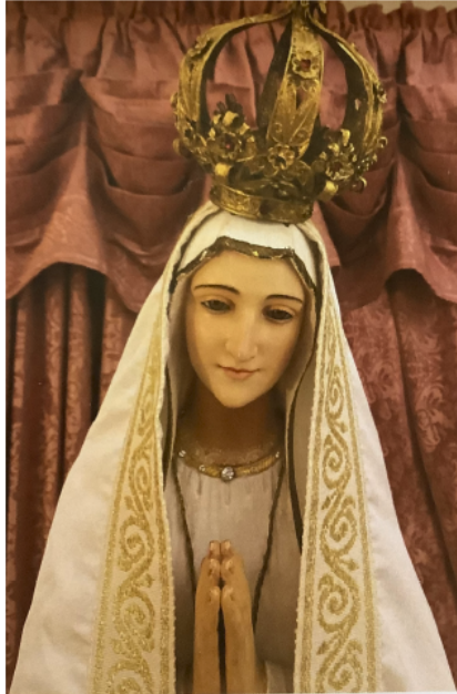
New York State Pilgrim Virgin

The New York State Pilgrim Virgin Statue of Our Lady of Fatima will be arriving here at Holy Name of Mary Church on October 13, at 6:30pm