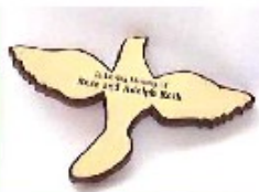
DOVE Carved Wood back plate. Brass front plate. 33 characters maximum.