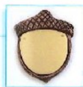
ACORN Cast bronze back plate. Brass front plate. 125 characters maximum.

PLEASE CHECK THE BOX OF THE ITEM YOU WOULD LIKE TO DONATE: