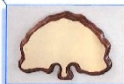
MINI TREE Carved Wood back plate. Brass front plate. 100 character maximum.