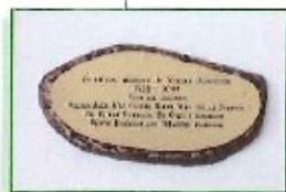
"A" STONE Cast bronze back plate. Brass front plate. 100 characters maximum.

*All payments must be received before names are memorialized.