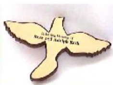
DOVE Carved Wood back plate. Brass front plate. 33 characters maximum.