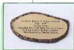
"A" STONE Cast bronze back plate. Brass front plate. 100 characters maximum.

*All payments must be received before names are memorialized.