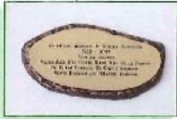
"A" STONE Cast bronze back plate. Brass front plate. 100 characters maximum.

*All payments must be received before names are memorialized.