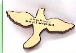
DOVE Carved Wood back plate. Brass front plate. 33 characters maximum.