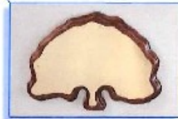
MINI TREE Carved Wood back plate. Brass front plate. 100 character maximum.