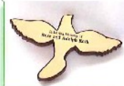
DOVE Carved Wood back plate. Brass front plate. 33 characters maximum.