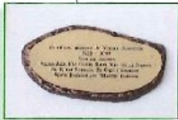
"A" STONE Cast bronze back plate. Brass front plate. 100 characters maximum.

*All payments must be received before names are memorialized.