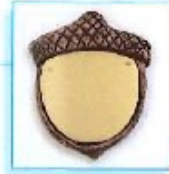
ACORN Cast bronze back plate. Brass front plate. 125 characters maximum.

PLEASE CHECK THE BOX OF THE ITEM YOU WOULD LIKE TO DONATE: