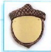
ACORN Cast bronze back plate. Brass front plate. 125 characters maximum.

PLEASE CHECK THE BOX OF THE ITEM YOU WOULD LIKE TO DONATE: