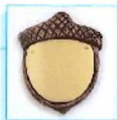
ACORN Cast bronze back plate. Brass front plate. 125 characters maximum.

PLEASE CHECK THE BOX OF THE ITEM YOU WOULD LIKE TO DONATE: