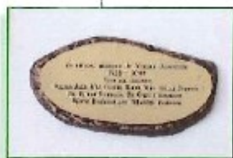
"A" STONE Cast bronze back plate. Brass front plate. 100 characters maximum.

*All payments must be received before names are memorialized.