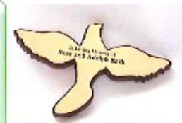
DOVE Carved Wood back plate. Brass front plate. 33 characters maximum.