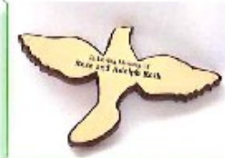
DOVE Carved Wood back plate. Brass front plate. 33 characters maximum.